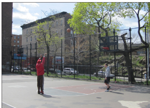
People's Park basketball courts in use today.

We counted 2,178 visitors in People's Park over the course of eight survey days, including one weekend and one weekday during each season.*