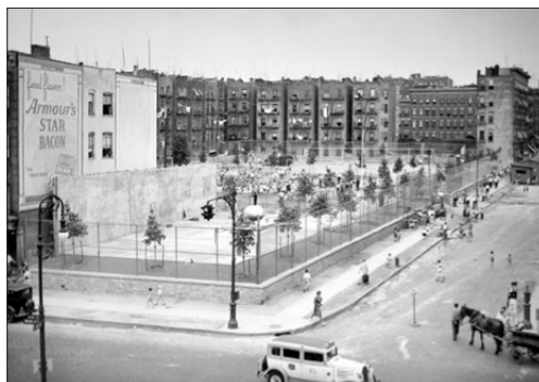
Bird's-Eye View of People's Park, the Bronx August 8, 1934, Max Ulrich/New York City Parks Photo Archive

People's Park is located in the Mott Haven/Port Morris section of the Bronx. The photos below show the playground in 1934, and the same courts in use today for a pick-up basketball game.